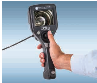
The FreedomView® has a 360° joystick control with a 110° articulating tip

Optim is very confident the FreedomView Videoscope will build upon the outstanding reputation our FreedomView Fiberscope has earned over the years with security personnel around the world.