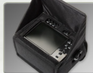
AV2 FIELD MONITOR PACK (optional)